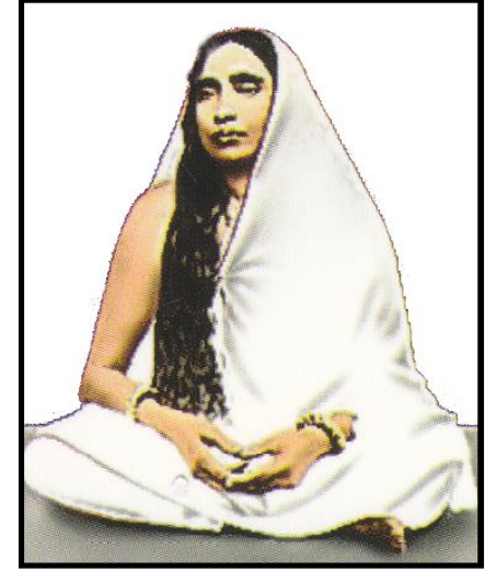
ANNAI SRI SARADA DEVI