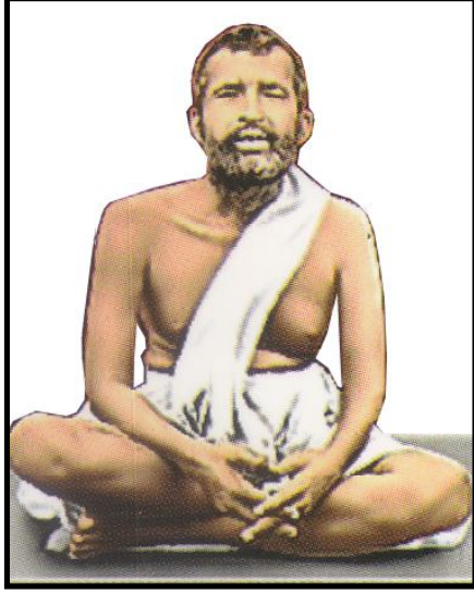
BAGAVAN SRI RAMAKRISHNAR